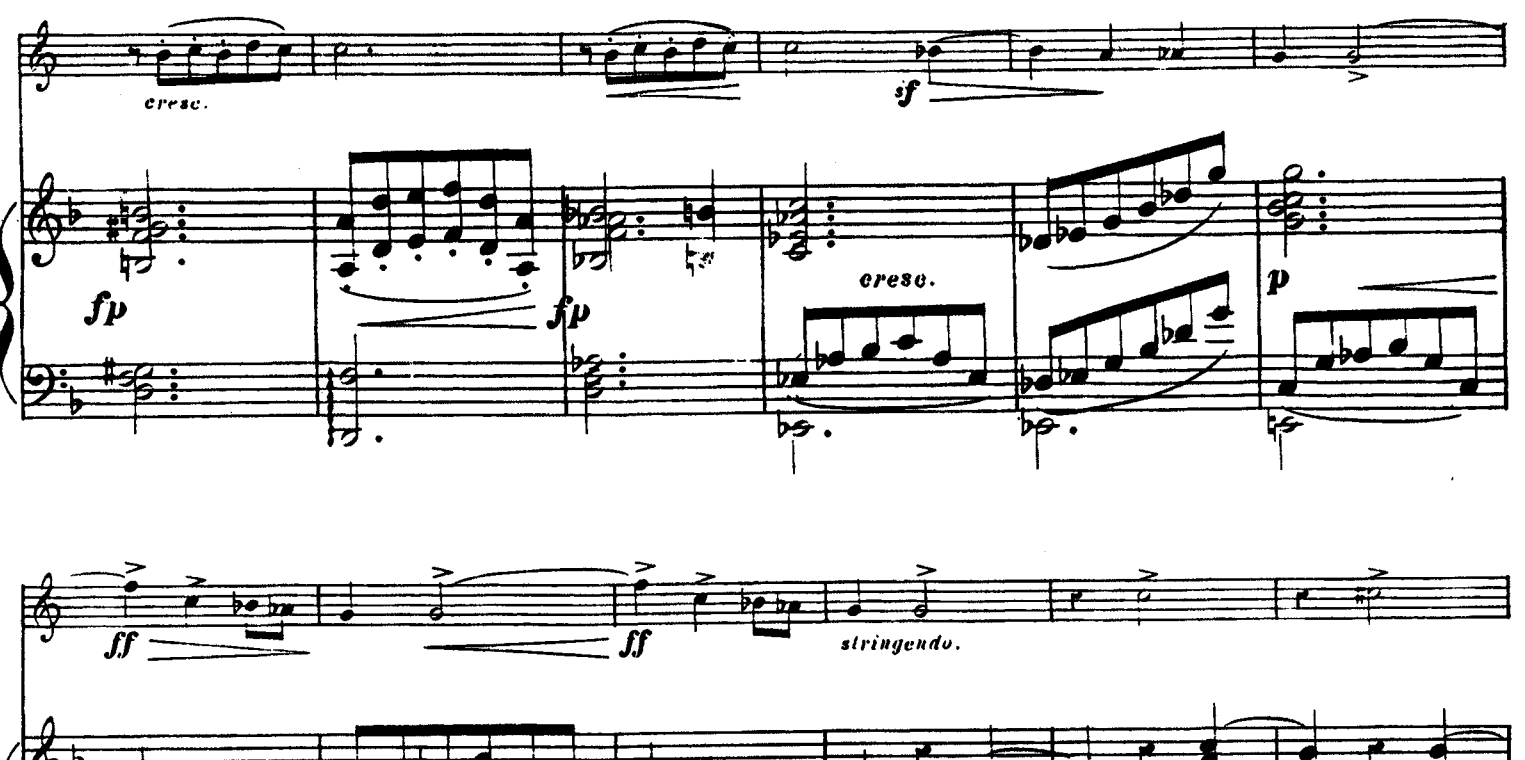
The Clarinet Institute of Los Angeles